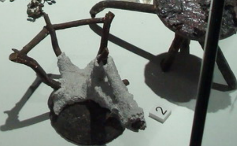
1. Microfusión Cristal Incorporado 2. Coladas Microfusión 3. Colada Cristal 4. Microfusión Cristal Incorporado sellado