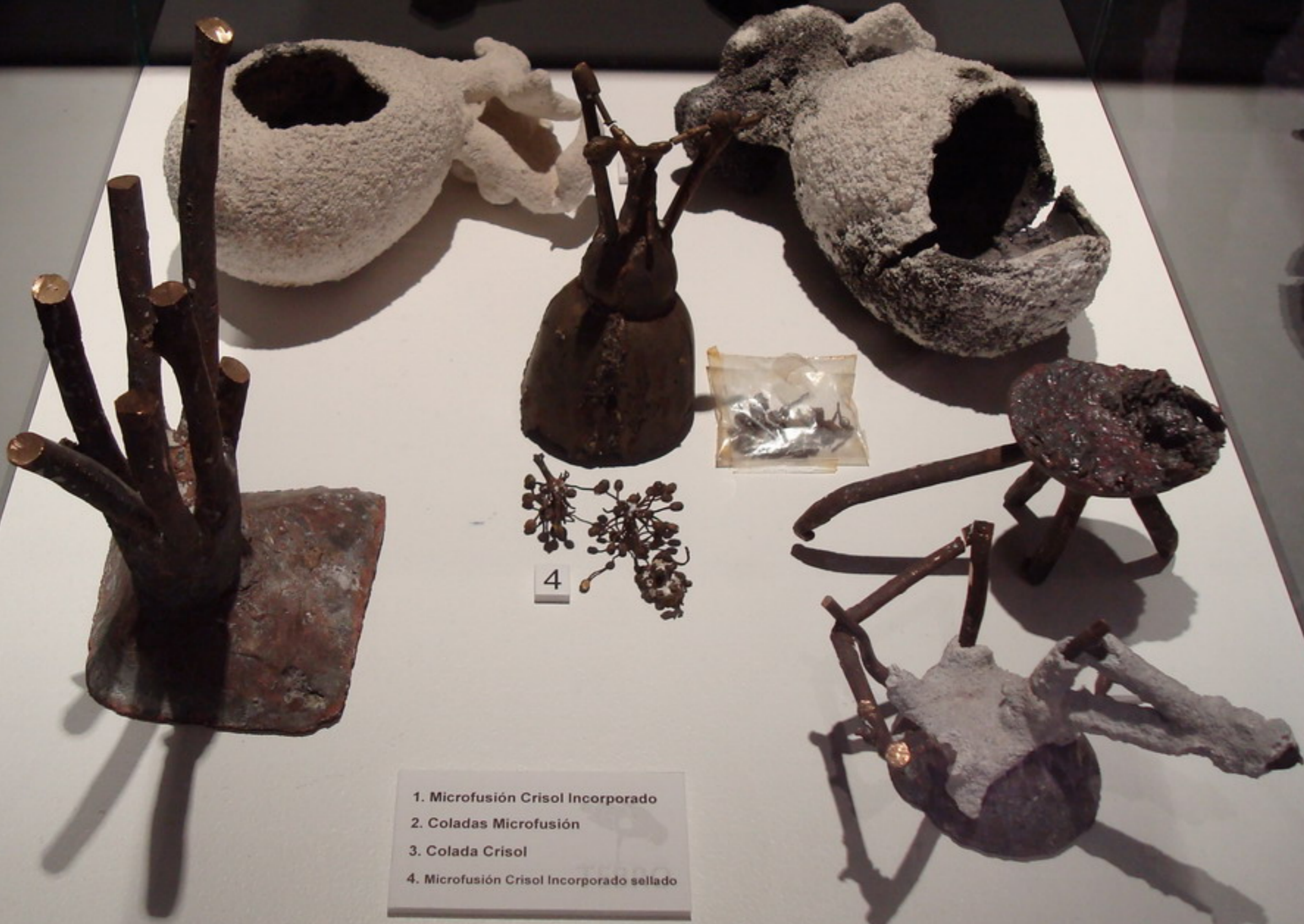
1. Microfusión Crisol Incorporado 2. Coladas Microfusión 3. Colada Crisol 4. Microfusión Crisol Incorporado sellado