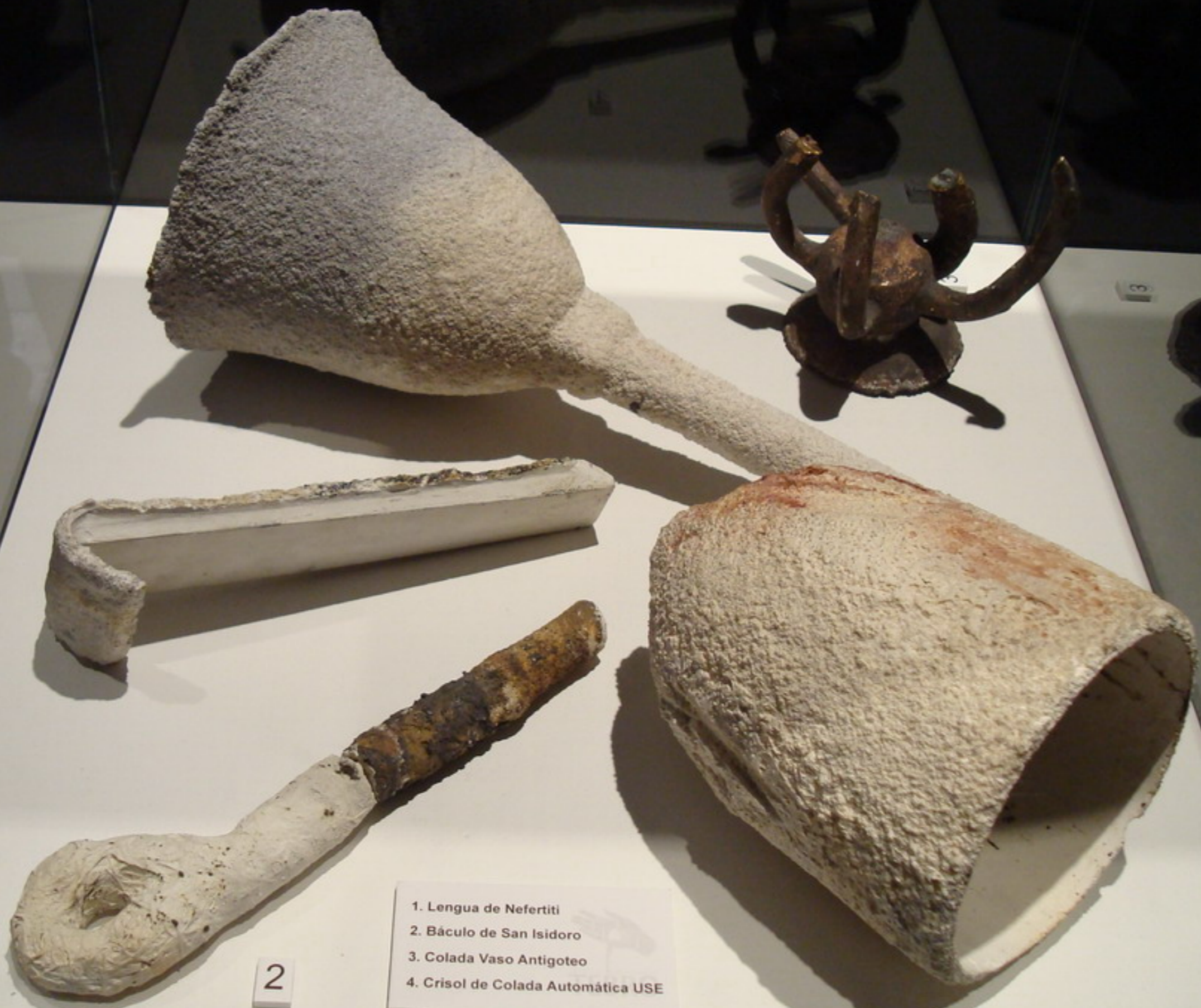
1. Lengua de Nefertiti 2. Báculo de San Isidoro 3. Colada Vaso Antigoteo 4. Crisol de Colada Automática USE